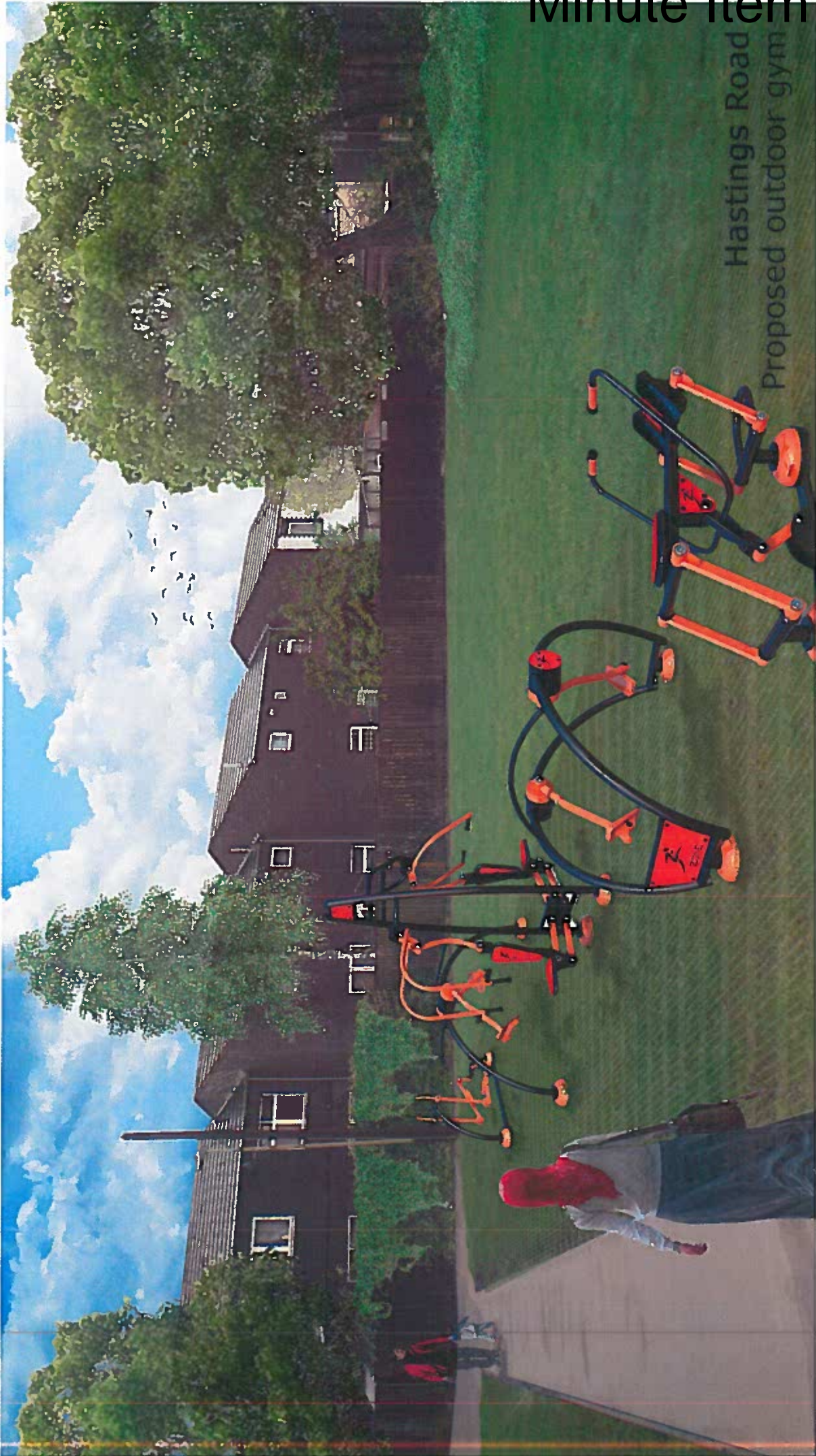
Hastings Road Proposed outdoor gym